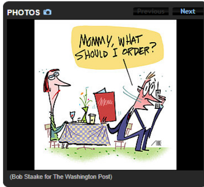
(Bob Staake for The Washington Post)

Next Week: The Pepys Show , or Tainted Diary Products